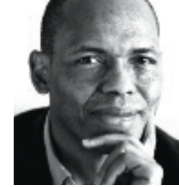
Tierno Monémbo

Catherine Mavrikakis was born in Chicago to a French mother and an Algerian-born Greek father. She split her childhood between Montreal, France and Michigan, and since 1979 has lived and worked in Montreal. She is the author of four novels, a play and several essays, and also works as a radio host.